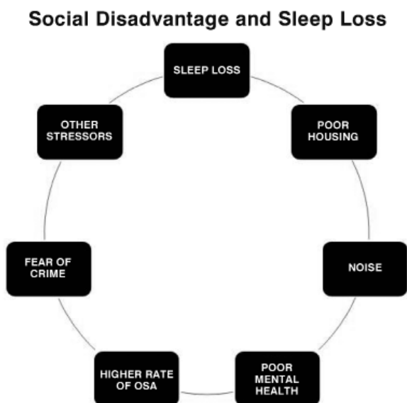
Figure 2 Interdependent mechanistic processes related to sleep loss in poorer urban areas

There are many diverse ways that social disadvantage and sleep loss inter-relate to contribute to ill-health. Some of these concepts are listed in Figure 2.